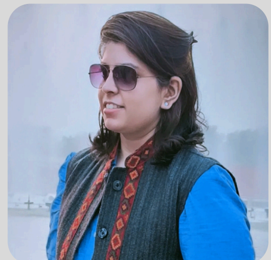
Er. Kritika India

Title: BAIoT-EMS: Consortium Network for Small-Medium Enterprises Management System with Blockchain and Augmented Intelligence of Things